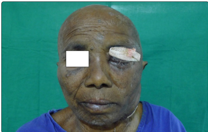
Figure 6. Patient before discharge

On Postoperative Day 10, Incision and drainage of scalp abscess was done and 12 days later secondary suturing was done. After 10 days of secondary suturing the patient improved symptomatically, the proptosis reduced and eyeball movements improved. The swelling in the scalp reduced and there was also an overall improvement in the general condition of the patient and the patient was discharged (Figure 6).