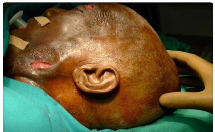
Figure 4. Left facial cellulitis – incision and drainage

On postoperative day 2, we noticed an increase in the size of the left facial swelling with spontaneous rupture at the left supraorbital and infraorbital region. Incision and Drainage of left facial cellulitis was done using oblique incision 2 cm long about 2 cm above the midline between angle of mandible and symphysis menti (Figure 4).