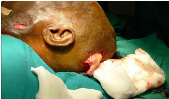
Figure 5. Scalp abscess incision and drainage

On Postoperative Day 9, the patient developed scalp cellulitis with abscess and was started on Linezolid (Figure 5).