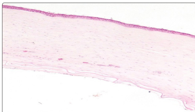
Figure1. Early histopathologic events in the cornea showing mild acanthosis in the epithelium, mild vascularization in the stroma, widespread ondulation in desemet’s membrane and detached endothelium (HE x40)

The most common findings on histopathological examination were collagenous stromal edema and detachment of collagen fibers. Depending on silicone oil exposure duration, hyalinization rather than stromal edema was observed in some tissues. Thickening of Bowman’s layer and irregularity together with vascular proliferation behind Bowman’s layer were observed. Stromal edema associated crackings were observed on Descemet’s membrane. Corneal epithelial layer also showed several changes such as; detachment from basement membrane and acantholytic changes. Figure 1 and 2 show histopathological findings of corneal buttons.