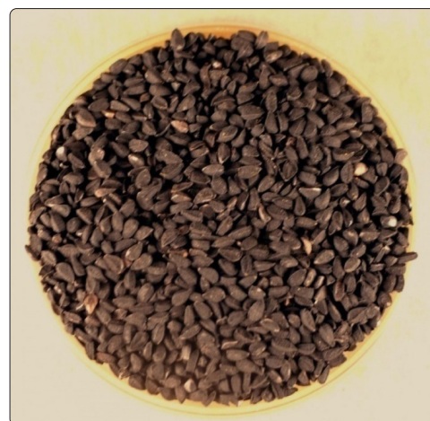
Seeds of Kalonji ( Nigella sativa )

The Black seeds are small black grains with a rough surface and an oily white interior, similar to onion seeds. The seeds have little bouquet, though when rubbed, their aroma resembles oregano. They have a slightly bitter, peppery flavor and a crunchy texture.